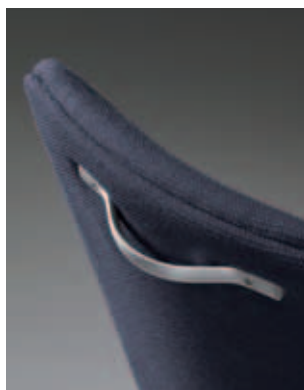
HANDLE Available on all models