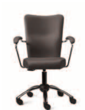
21/17A Task chair available with all back styles 95 61 62 46+9 12