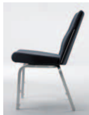
CONFERENCE BACK RAKE Standard