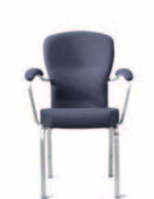
21/2A Arms available on all models. Add 17cm to width. Weight increases by 0.7Kg