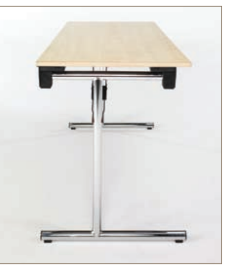
Leg configuration shown on 60cm wide table