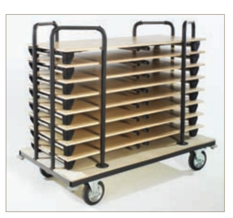
Table Trucks (TTF.C)

iii. Burgess wood laminate with hardwood leading edge. (W)