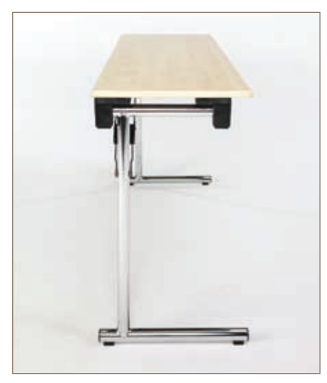
Leg configuration shown on 45cm wide table

A selection of table top finishes, detailed in the brochure, are available and the frames can be finished in a choice of chrome plated mild steel, or a wide selection of epoxy powder coated colours.