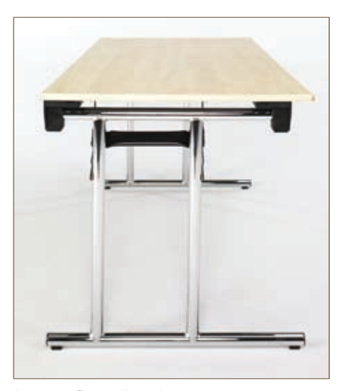
Leg configuration shown on 75cm wide table

We have a CAD layout service available to assist clients with their product selection and specification, helping to maximise banqueting or restaurant capacity. Further details upon request.